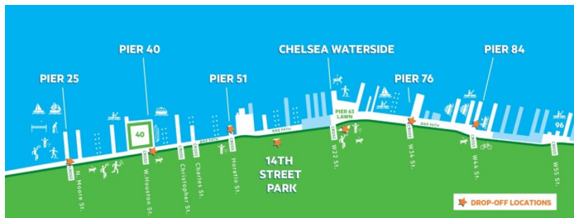
Fig. 1 (above) | Map of the compost drop-off locations throughout Hudson River Park.