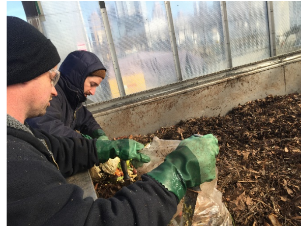
Fig. 2 (left) | Organic waste is collected at HRPK's compost center and processed in an aerating vessel in order to produce compost.