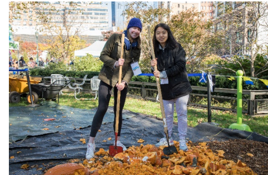
Fig. 4 (right) | Volunteers supported the composting process at Pumpkin Smash

HRPK's 2nd annual Pumpkin Smash at Chelsea Waterside Park welcomed 1200 locals in smashing over 2,000 lbs. of old Halloween pumpkins. Families also learned about the benefits of composting to the Park and tips on how to compost at home.